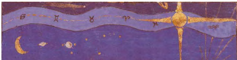
Detail from the first folio of Liber Novus , showing the zodiacal precession of the equinoxes. Liber Novus , Liber Primus, folio i recto.

The central sketch suggests a spring day with a ship setting sail on a voyage. Below, the painting reaches down through the waters of creation to primordial earth and its fiery central magma. And above, “you see the far-off forest and mountains, and above them your vision climbs to the realms of the stars” (LN, 264i).