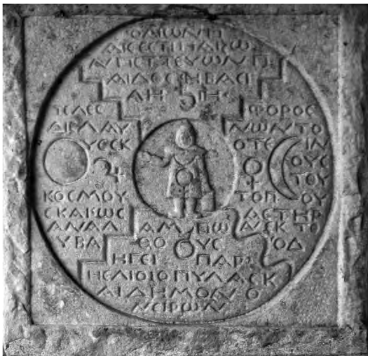
Jung's Aion Lapis , completed in 1950 and located beside his Bollingen Tower.

Aion is a child playing—Wagering on draughts—Kingship of a Child Telesphoros traverses the dark regions of this Cosmos A flashing Star from the Depths Guiding way to the Gates of the Sun and to the Land of Dreams 85