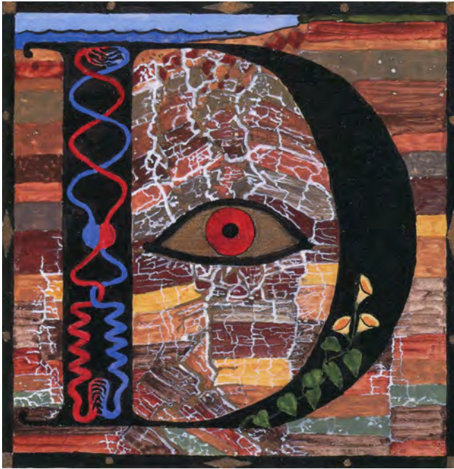
Detail of the historiated initial beginning, Liber Secundus (the second book), of Liber Novus . A force like molten basalt is pushing through geologic fissures, extending up from the depths. Beside this image, a human heart and circulatory system link the visible world with the unseen depths. Liber Novus , Liber Secundus, folio 1.

dream, discovered the ageless story, the rhizome from which he sprang. At least, so it seemed to him. It linked him with the past, with the ancestral life that continued within him, and with contemporary time. It also bound him to the future, to a new dawn and a destiny: