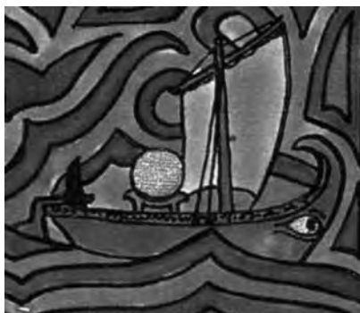
Detail, Liber Novus , Liber Secundus, folio 64.

the fourth month, has begun. “Learn from the suffering of a crucified God.” The new aeon signaled emergence of a transforming divine image. Jung had seen it.