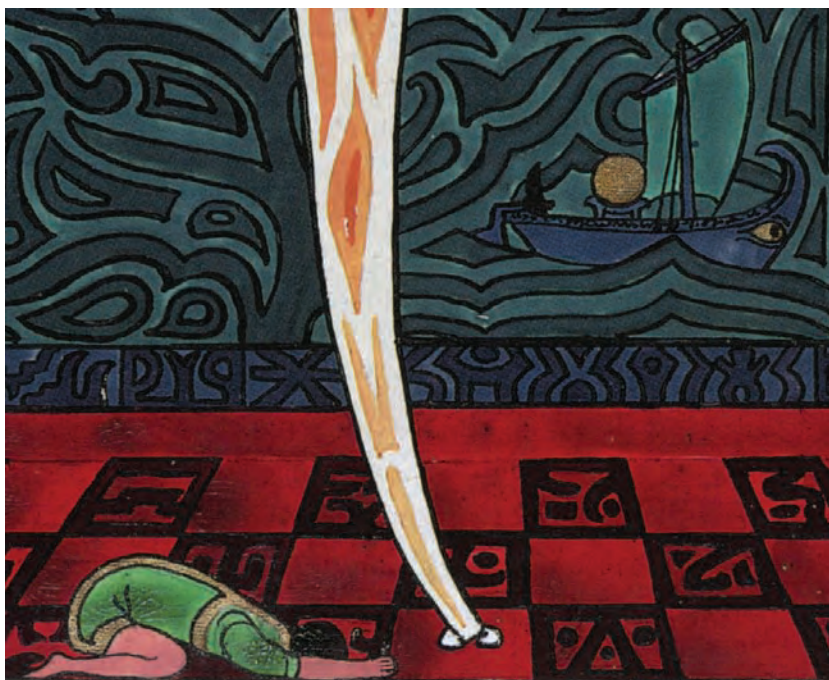
Detail, Liber Novus , Liber Secundus, folio 64.